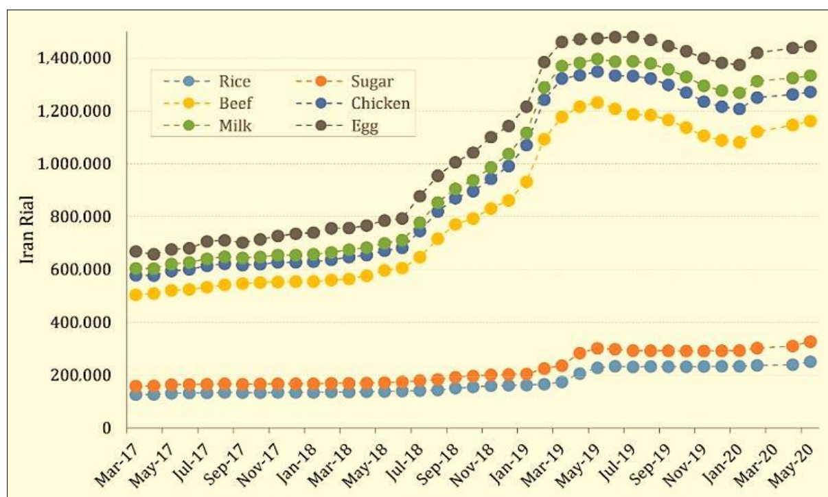
Fig. 2. Prices of foods and beverages in Iran from 2017 to 2020 (Rial per \text{kg}^{-1} for rice, beef, sugar, and chicken; Rial per liter for milk; Rial per piece for egg) (Akpan and Aya, 2009).

With the outbreak of coronavirus in Iran, the government has decided to subsidize low-income households to prevent food insecurity and food supply. Under these circumstances, this decision was not an effective strategy to improve food security (Pakravan-Charvadeh et al., 2020). As can be seen in Fig. 2, considering the relative increase in subsidies and workers' wages in 2020-2021, the purchasing power of each Iranian has decreased by about 30% compared to previous years (Akpan and Aya, 2009). Also, the ineffective policies of the government to deal with the consequences of the economic crisis of the coronavirus have led to a significant increase in food prices and a decrease in people's incomes at the same time, which ultimately leads to malnutrition in low-income households. Fig. 2 shows the trend of a significant increase in the price of various foods from 2017 to 2020.