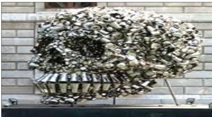
Fig. 1. Death's Head, (1943).

Pablo Picasso must have long gone, but his masterpieces live on. Picasso's works express covertly or overtly, the prevailing circumstances of his time, his inner being, his emotions and thoughts in his works. His assemblage piece Death's Head (Fig. 1), a bronze sculpture of a pitted, scabrous skull, Joie de vivre , etc, which he did during the world war II expressed his bleakest moment. Picasso's most famous assemblage work, entitled: Bull's Head (Fig. 2), was done during one of his wittiest periods. Bull's Head is a sculpture made from a discarded bicycle saddle and handlebars. The work consists of two elements. The identity of the found objects, though not disguised, isn't emphasized. There is no attempt to play down the real-world identity of the constituent parts. The Bull's Head sculpture reductiveness and simplicity draw attention (Segura et al., 2016). Concerning the sculpture, the author opined that At once both childlike and highly sophisticated in its simplicity, its stands as an assertion of the transforming power of the human imagination at a time when human values were under siege.