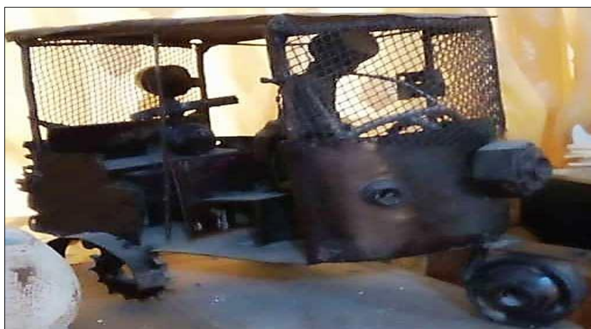
Fig. 6. Keke Rider, (2017).

Edidiong is a budding but prolific artist from Akwa Ibom State, Nigeria. He is dexterous in the use of mixed media to render sculptures. Tricycle popularly called (KEKE NAPEP) is a popular means of transportation by the middle class worldwide and major towns in Nigeria today. In this piece, entitled "Keke Rider," the artist tries to render a table-top 3-dimensional sculpture made up of discarded welder' sand mechanical parts, assembled in an assemblage piece (Fig. 6). Collecting discarded materials from the junks and the streets is a practical approach to waste management, ultimately converting waste-to- treasure-to wealth.