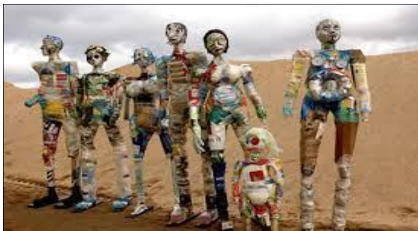
Fig. 3. Amanam, popularly called Immortal by his Seven Wasted Men.

the story of each individual through the things they discard: a child's drawings, a shopping list, a birthday card etc. The artist enjoys working with discarded household waste, recycled them into sculpture, also incorporating mechanical elements such as the working part of toys and clocks. To turn wastes into treasures, reader also source her materials from city dumps, roadsides, and thrift shops. Her popular quotes: I try wherever possible to use reclaimed materials, things with a history that have been discarded and might otherwise end up in the landfill.