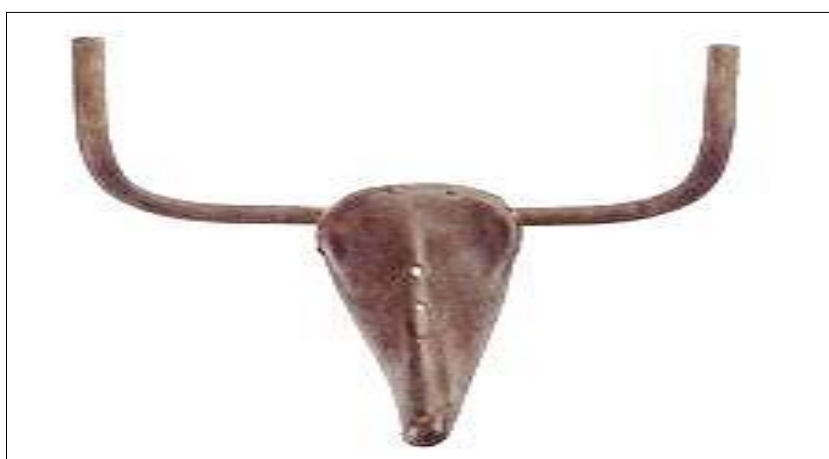
Fig. 2. Bull's Head, (1942).