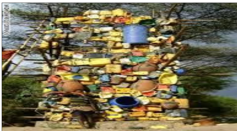
Fig. 4. Jerekina.