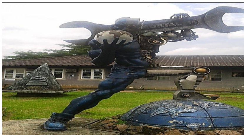
Fig. 7. Tomorrow's, (2013).

Other waste management efforts approach creditable to an artist in waste management; waste-to-wealth processes also include.