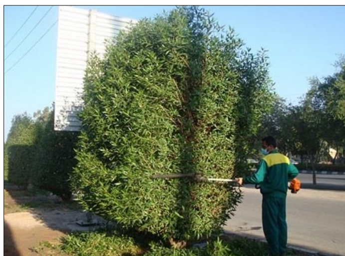
Fig. 2. Pruning and shaping of Conocarpus in urban areas (Kashefi et al., 2014).

The roots of this tree, in addition to severe and unprecedented destruction of urban infrastructure, have caused the most severe damage to the facilities of Water and Sewerage Company including severe destruction of water pipes and then the entry and blockage of the network of water facilities, severe destruction of tanks and pumping stations Water, severe pollution of drinking water due to mixing with city gas and sewage,