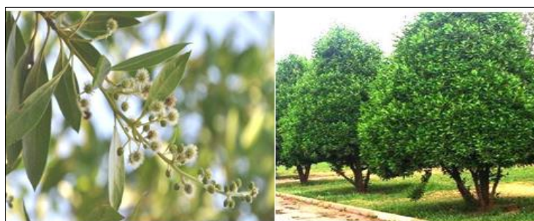
Fig. 1. Conocarpus tree, leaves and flowers (Safwat et al., 2018).